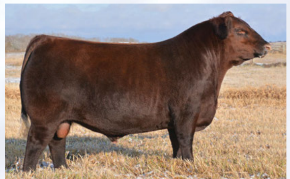
Red Six Mile Signature 295B Sire of Embryos

A neat opportunity to get genetics off the moderate made, powerfully constructed Blair's Nice 25Y donor. A maternal sib to these embryo's sold to Timber Creek in Texas in the Opportunity Knocks 2020 sale. 25Y is deceased and these embryos are unique and rare. Guaranteeing two (2) pregnancies, if implanted by a certified technician. Embryos are stored at Bow Valley Genetics, AB. Offered by Blairs.Ag Cattle Co.