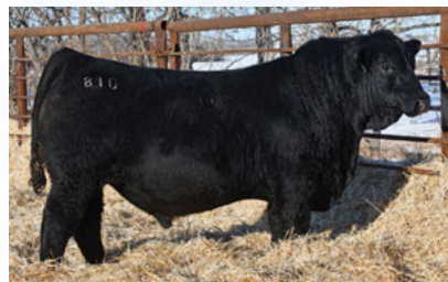
RF Haymaker 018G Uppercut son