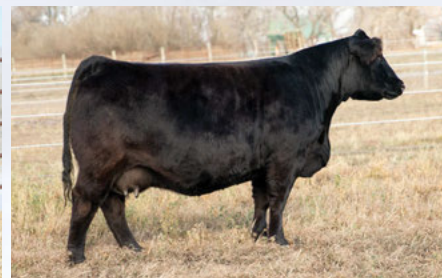
Double Bar D Bette 477F

$45,000 Bankroll daughter at Wheatland/Michelson