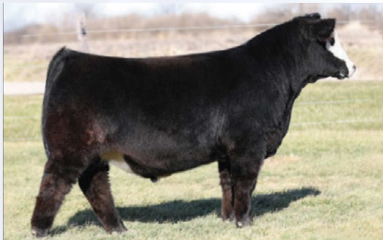
LLW Card True North G71 Sire of Lot 88A Embryos

Embryos are stored at Bow Valley Genetics, AB. Offered by G R Simmentals