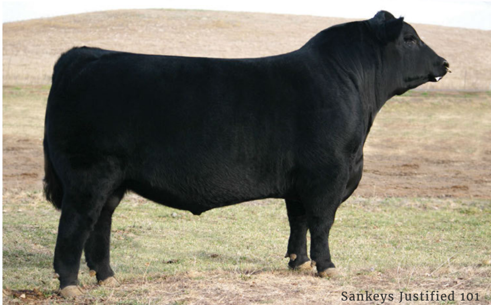
Sankeys Justified 101

Lot 36 Ten (10) Units of Semen Sankeys Justified 101 Male IMP 101Y 1762026 Jan. 16, 2011