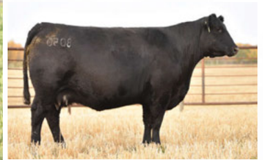
JL Lady 8050 Renown daughter at Dudgeon Cattle Co.

Lot Eleven (11) Units of Semen 29 Male IMP 3439A 1887276 Jan. 7, 2013 S A V Renown 3439