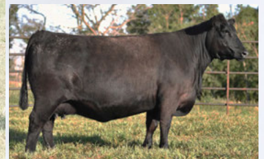
JL Forever Lady 5559

Final Answer daughter at MWC Investments Inc.