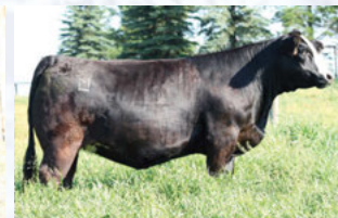
Daughter of 27C