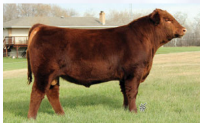
Sakic X Bayberry 1Z

$9,000 high selling daughter at Keystone Classic