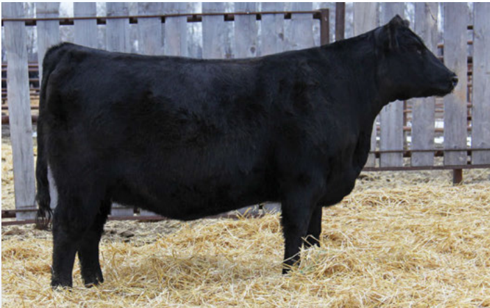
Resource Daughter In production at Premier Livestock and Otter Creek