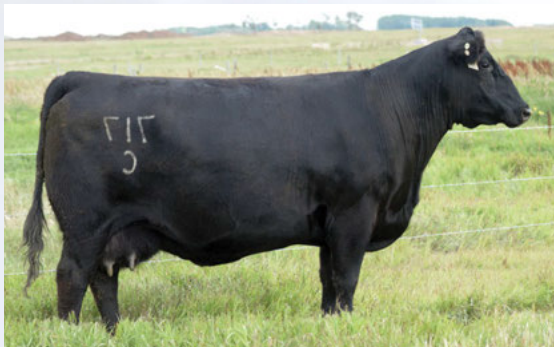
Blair's Mercedes 717C $27,500 Resource daughter at D & N Livestock

Stored at Millennium Genetics, AB Offered by Jacobs Ranch