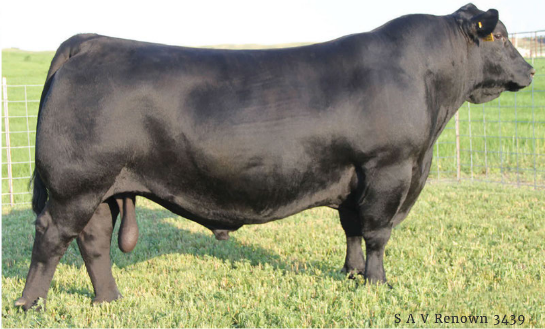
S A V Renown 3439