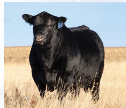
PM Executive Decision 5'17 Maternal Brother to Embryos

The Showman semen recently commanded $1750 to $1850 per straw. He definitely is a young sire with tons of excitement surrounding him. His first two daughters offered for sale sold for well over $20,000 each. Word is, his bull calves will be highly sought after this spring. The dam is from my most prolific cow family and is dam to PM Executive Decision who is making his mark in the Angus world. We are anxiously awaiting several 124A embryos to be born this winter. A no miss cow bred to a leading edge bull should be a sound investment. Embryos are stored at Bow Valley Genetics and are qualified for Canada, USA, EU and AUS. Offered by Poplar Meadows Angus