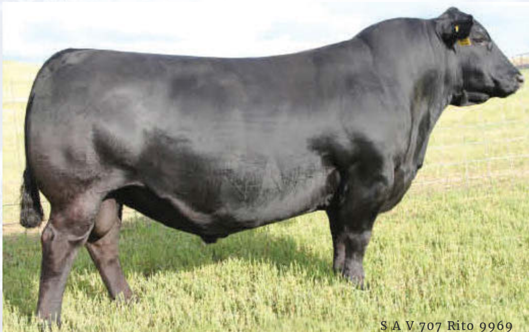
S A V 707 Rito 9969

Semen is stored at Bar 5 Stock Farms , Markdale, ON. Offered by Vissers Angus