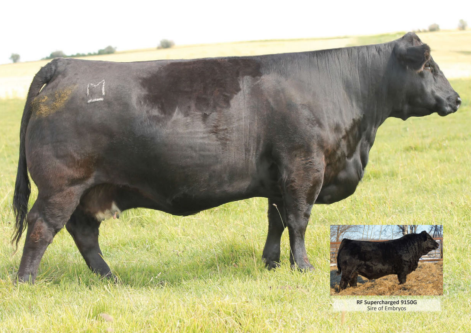
RF Supercharged 9150G Sire of Embryos