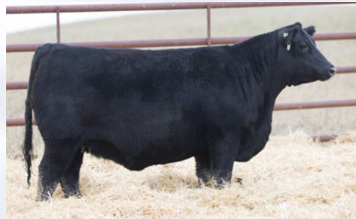
J Square S Forever Lady 905G Maternal Sibling to Lot 41A embryos, Full Sibling to Lot 41B Embryos

S PLAINVIEW LUTTON E102 PLEASANT VALLEY LUTE 1207 CHERRY KNOLL ELSA 8014 D HF TIGER 5T TRIPLE L J&S FOREVER LADY 301Y GDAR FOREVER LADY 9136