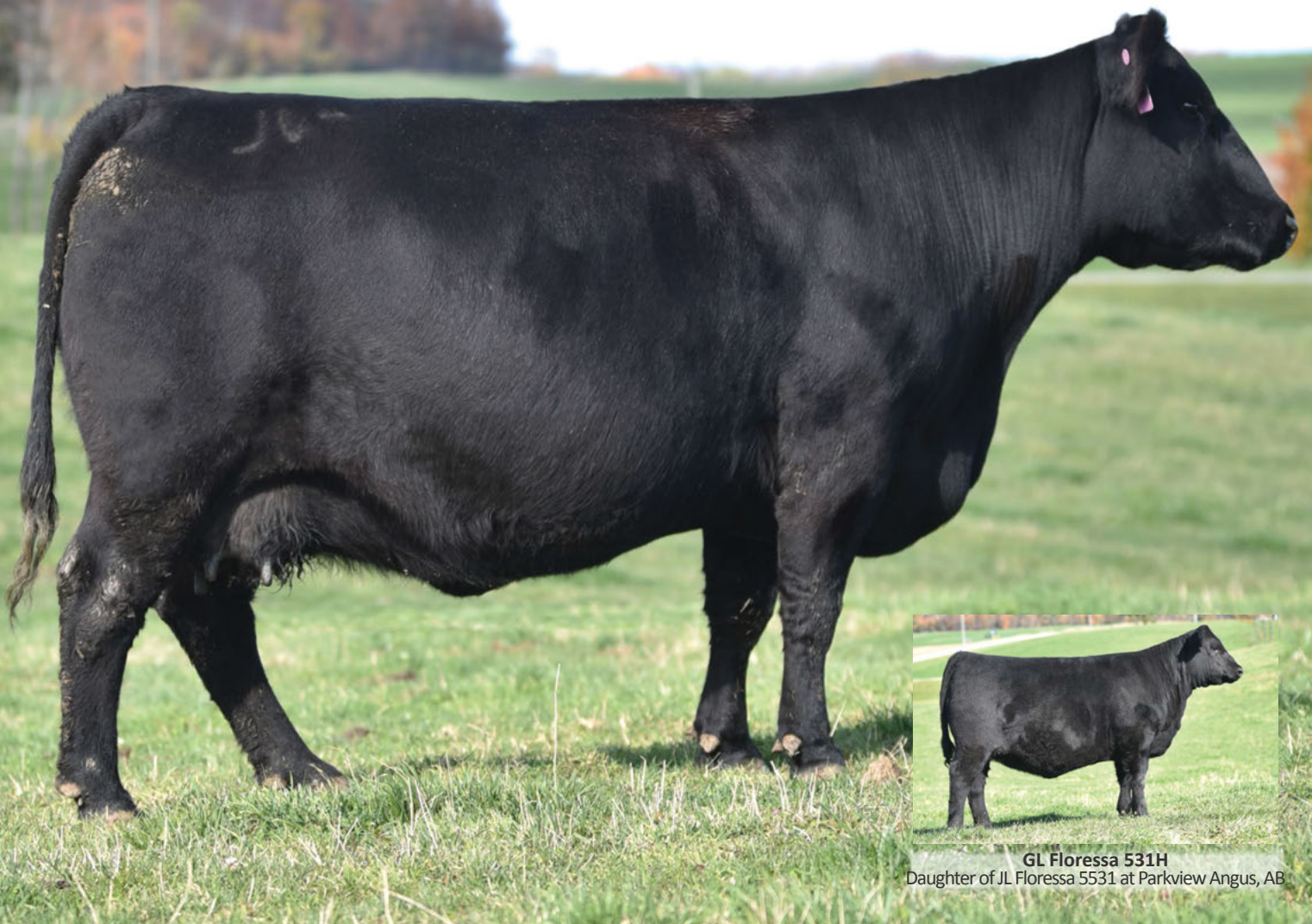
GL Floressa 531H Daughter of JL Floressa 5531 at Parkview Angus, AB