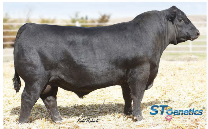
Musgrave Crackerjack Sire of Lot 33A Embryos