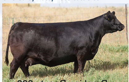
Brooking Beauty 333 Dam of Brooking Beauty 8138