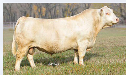
LT Sundance 2251 PLD Sire of Lot 70B Embryos

Guaranteeing one (1) pregnancy, if implanted by a certified technician. Embryos are stored at Bow Valley Genetics, AB. Offered by Prairie Cove Charolais