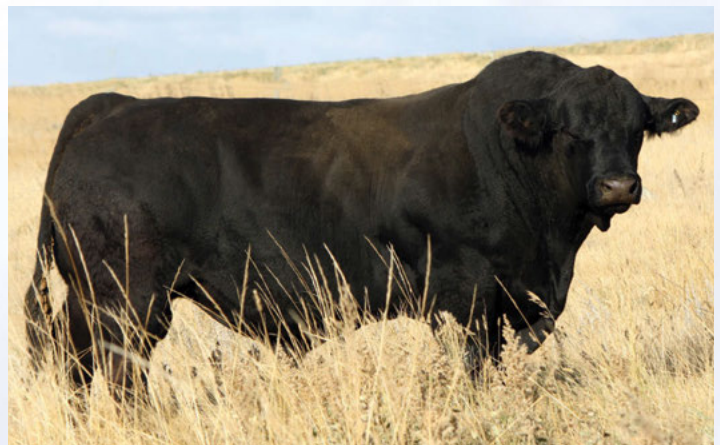
Springcreek Liner 56U Sire of Lot 58B Embryos