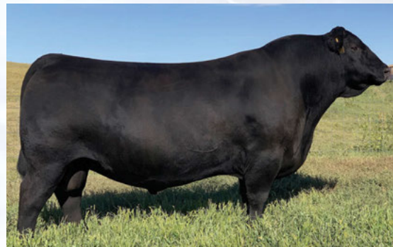
S A V Territory 7225 Sire of Embryos

Guaranteeing one (1) pregnancy per three embryos, if implanted by a certified technician. Embryos are stored at Alta Genetics, AB. Offered by Sunderland Ranch