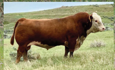
NJW 73S Rimrock 27C ET Sire of Embryos