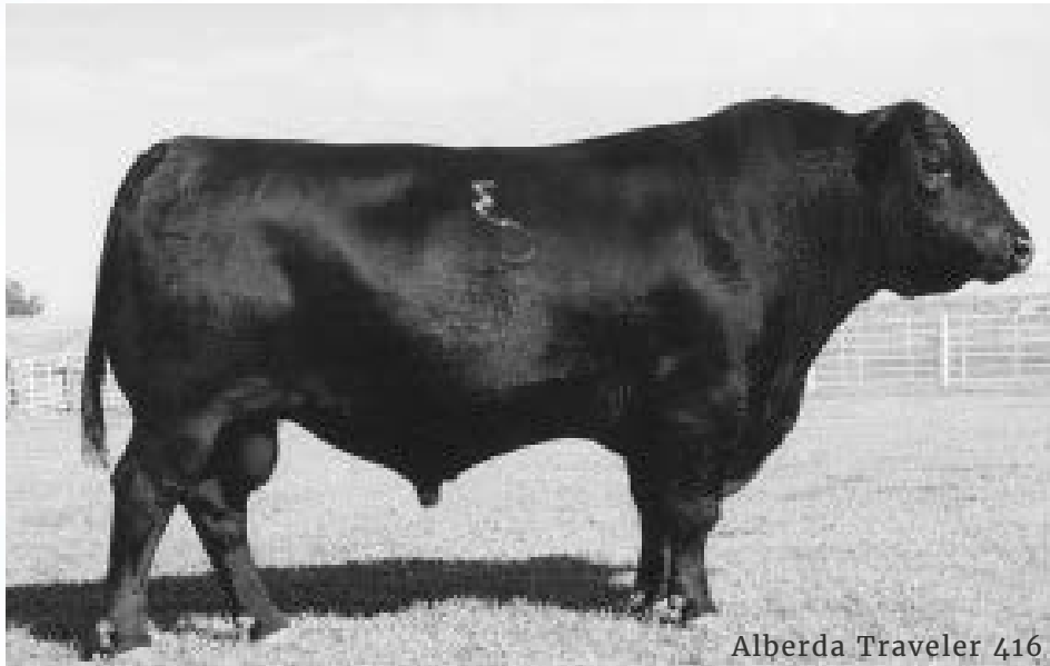
Alberda Traveler 416