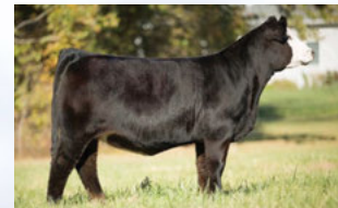
LLSF Flirt F195 Pictured as a calf