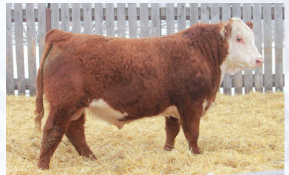
Blair-Athol Golden Jet 9H Full Sibling to Embryos