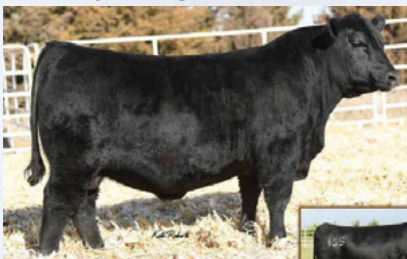
Mohnen Lieutenant Son of Mohnen General 548