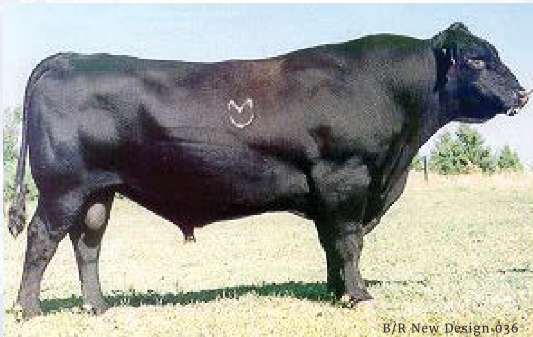
B/R New Design 036

S V D A R NEW TREND 315 A A R NEW TREND V D A R LUCY 704 K&K TOP GUN D B/R BLACKCAP EMPRESS 76 QLC A70 BLKCP EMPRESS E43T Semen is FOB to Alta Genetics, AB. Offered by Willow Springs Stock Farm