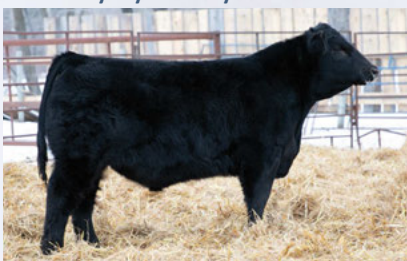
Jaymarandy Lil Man Henry 21H Son of Young Dale Tilda 733E

Embryos are stored at Jaymarandy Livestock and are for Domestic sale only. Offered by Jaymarandy Livestock