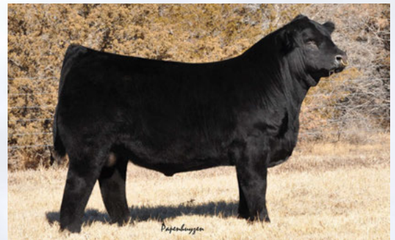
Cottage Lake Border Agent Sire of Embryos