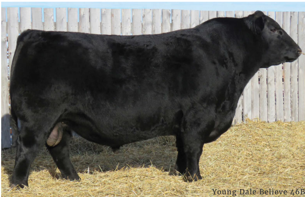
Young Dale Believe 46B