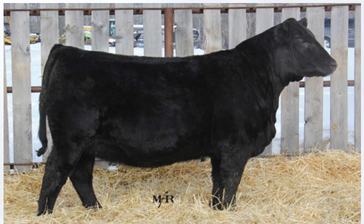
Renown Daughter In production at Premier Livestock