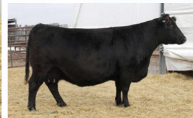
Young Dale Grace 126Z

Dam of Believe, and one of the most influential Angus cows in Canada