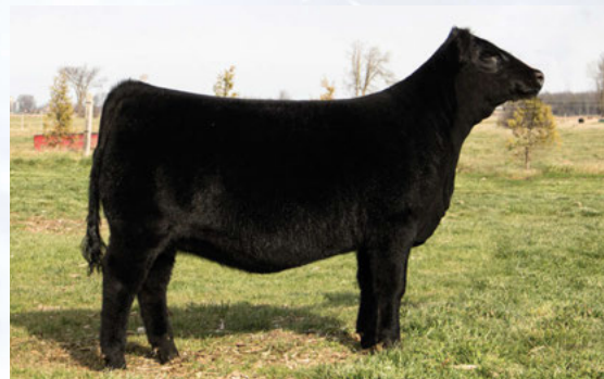
Premier Pride 015

Offered by Premier Livestock, Mainstream Genetics, Hasson Livestock, Dudgeon Cattle Co. and MKC