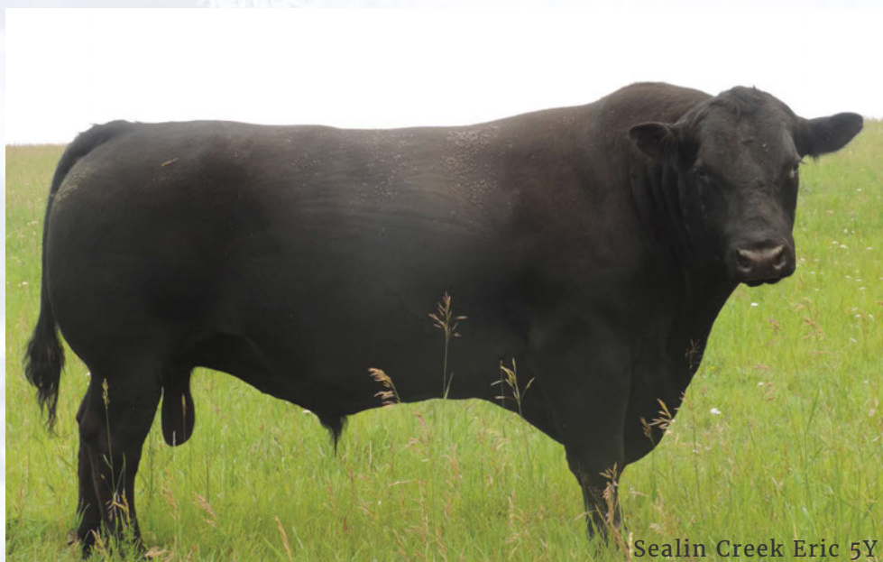
Sealin Creek Eric 5Y

We are offering 10 doses of the ROV Show Bull of the Year in 2012! Justified has bred and delivered champions, high sellers and very good bulls and females all across North America. This now deceased sire is one to add to your semen tank while you can. The semen is in limited supply, get a hold of this frozen opportunity! Semen is stored at Alta Genetics, AB. Offered by Justamere Ranches