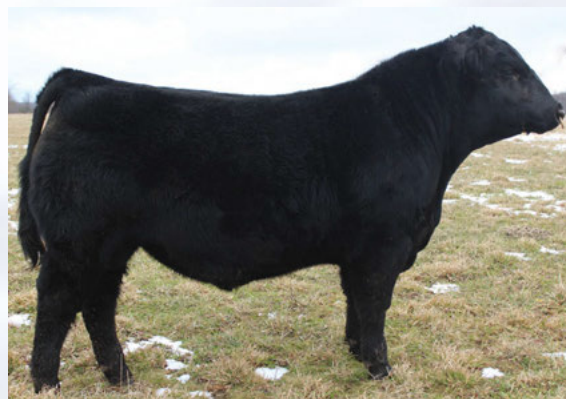
Harprey Jullian 37G Son of Young Dale Julian 64E