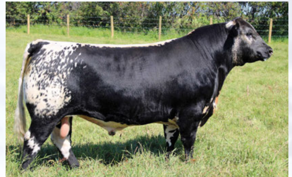
Unlimitedspots GRNWD Future20F Sire of Embryos

Guaranteeing one (1) pregnancy, if implanted by a certified technician. Offered by Gilchrist Farms