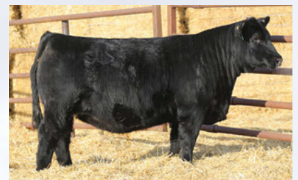
Miss R Plus 9081G Uppercut daughter