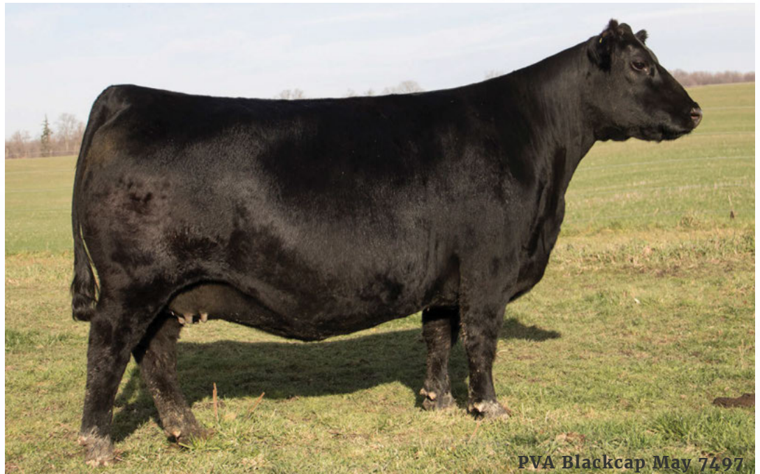
PVA Blackcap May 7497