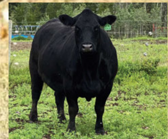
PM Blossom 124'13 Dam to the $33,000 PM Executive Decision bull who sold to W Sunrise Angus and is just starting to make his mark in the Angus world