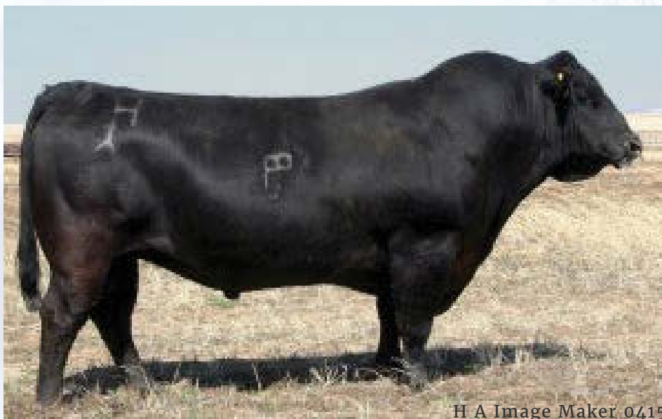
H A Image Maker 0415

Semen is FOB to Alta Genetics, AB. Offered by Willow Springs Stock Farm