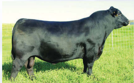
S A V Cutting Edge 4857 Sire of Lot 89B Embryos