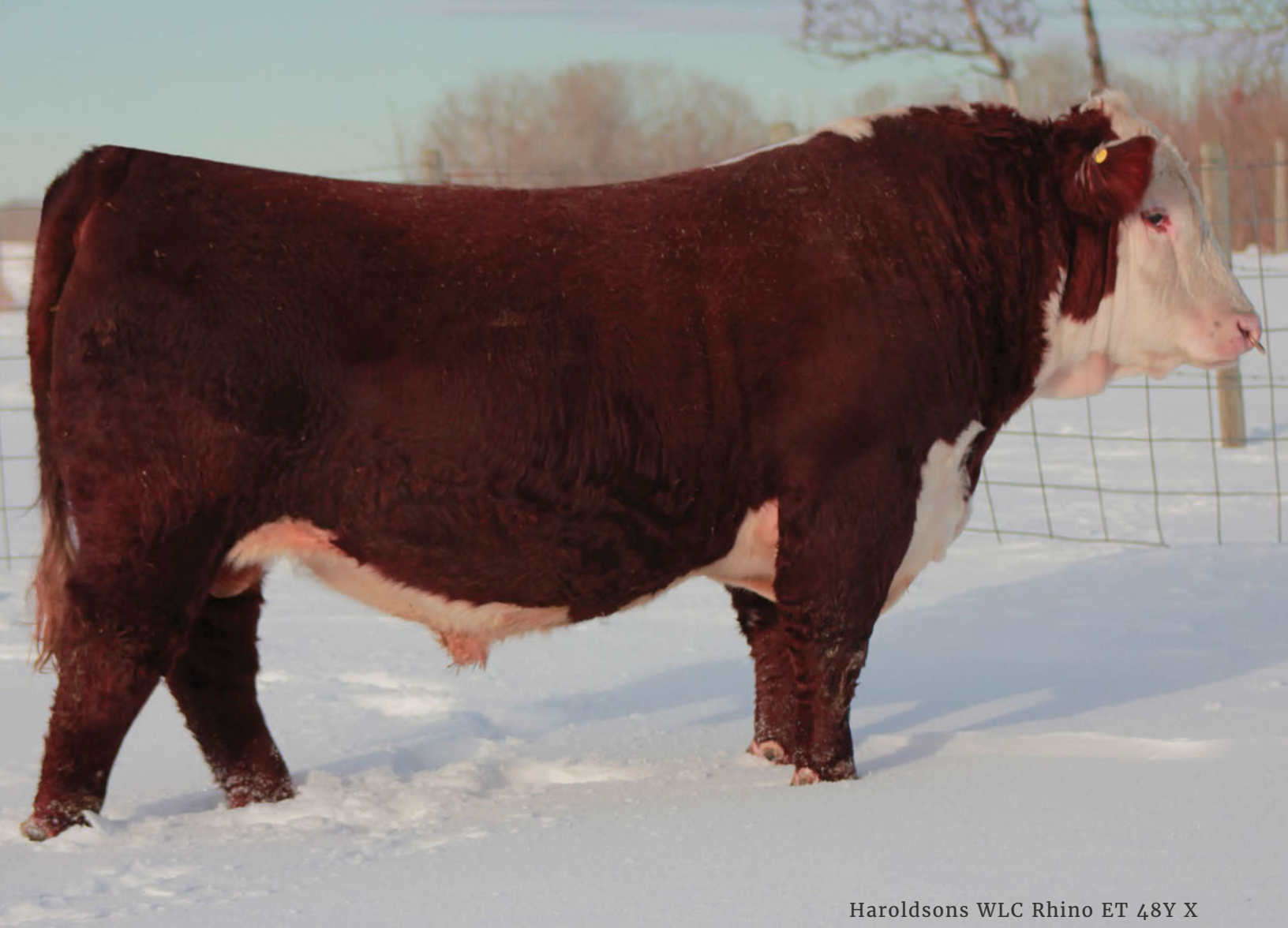
Haroldsons WLC Rhino ET 48Y X