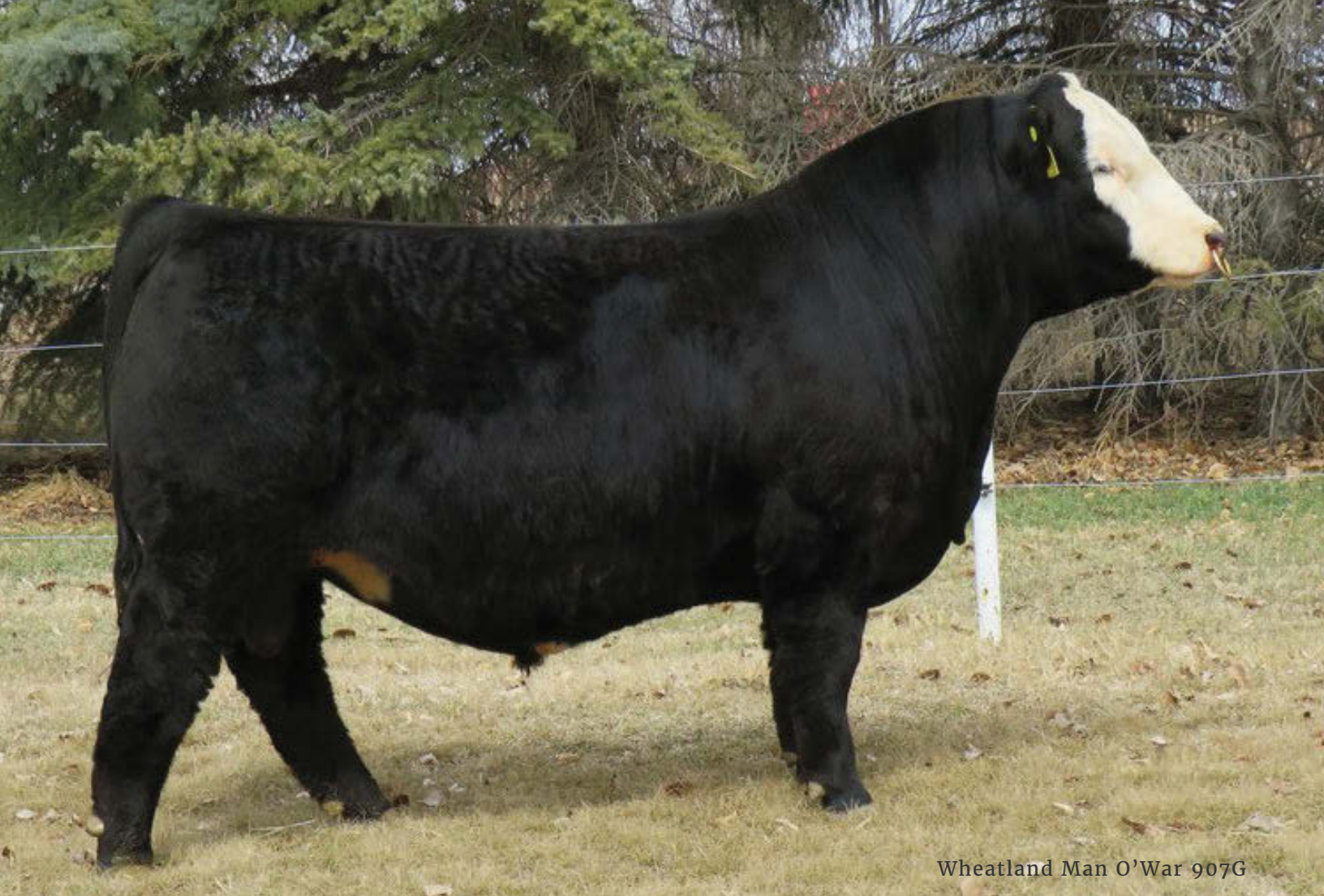
Wheatland Man O'War 907G