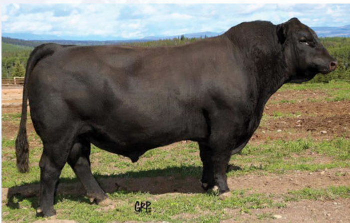
Bar-E-L Natural Law 52Y Sire of Lot 33B Embryos