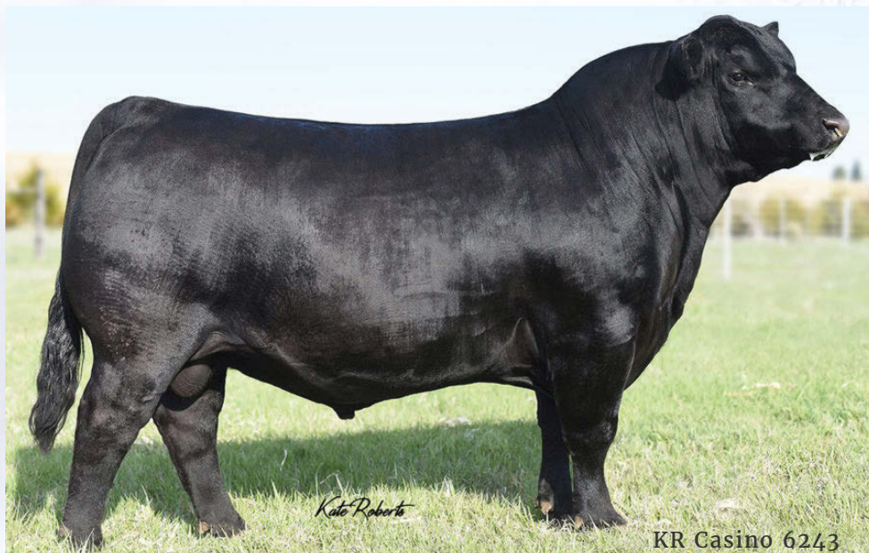
KR Casino 6243