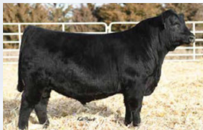
Mohnen General 970 Son of Mohnen General 548