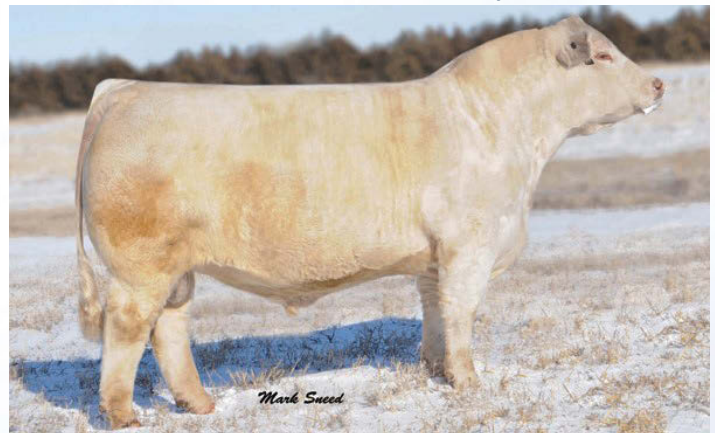
TR PZC Rapid Fire 9775ET

Semen is stored at Bow Valley Genetics, AB. Offered by Serhienko Cattle Co.