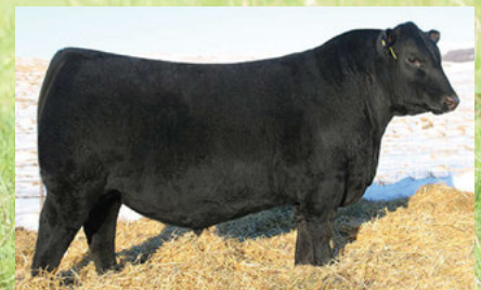
S A V Bloodline 9578 Sire of Embryos