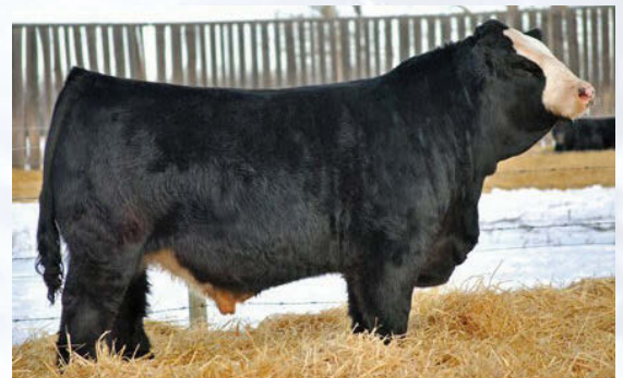
RF Merchant 481B Sire of Embryos

Guaranteeing two (2) pregnancies per package, if implanted by a certified technician. Embryos are stored at Davis-Rairdan Embryo Transplants Ltd, AB. Offered by Blairs.Ag Cattle Co.