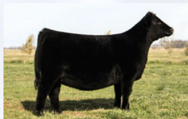
Premier Queenette 20H Fusion Daughter