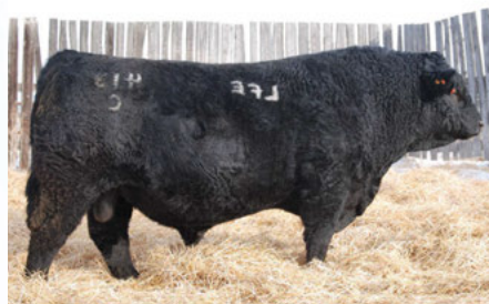
LFE McDavid 413C