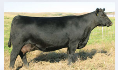
S A V Blackcap May 4563 Flush sister of S A V Blackcap May 4562