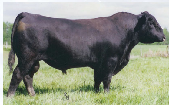
Kilmaurs Daquantae 1H Sire of Embryos

IMP 16W is an excellent Traveler bred female and top seller from the famous Wilson Cattle Co Forever Lady family in Indiana. Daquantae 1H was a $27,000 high seller bull in the 1999 when one-half interest sold to Geis Angus. He sires females that make terrific cows with exceptionally good udders and have produced offspring among the very best at LLB and at Geis, many are ELITE DAMS. The dam of the $70,000 top selling bull in our 2009 spring sale was a Daquantae 1H daughter and he also appear in the pedigrees of many of our herd sire. Watch for his daughters, they are the good ones. Guaranteeing one (1) pregnancy, if implanted by a certified technician. Embryos are stored at Davis-Rairdan Embryo Transplants Ltd., AB. Offered by LLB Angus