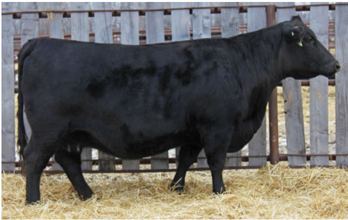
Rehorst Eliminator June 502C Donor Female Currently in Embryo Transfer