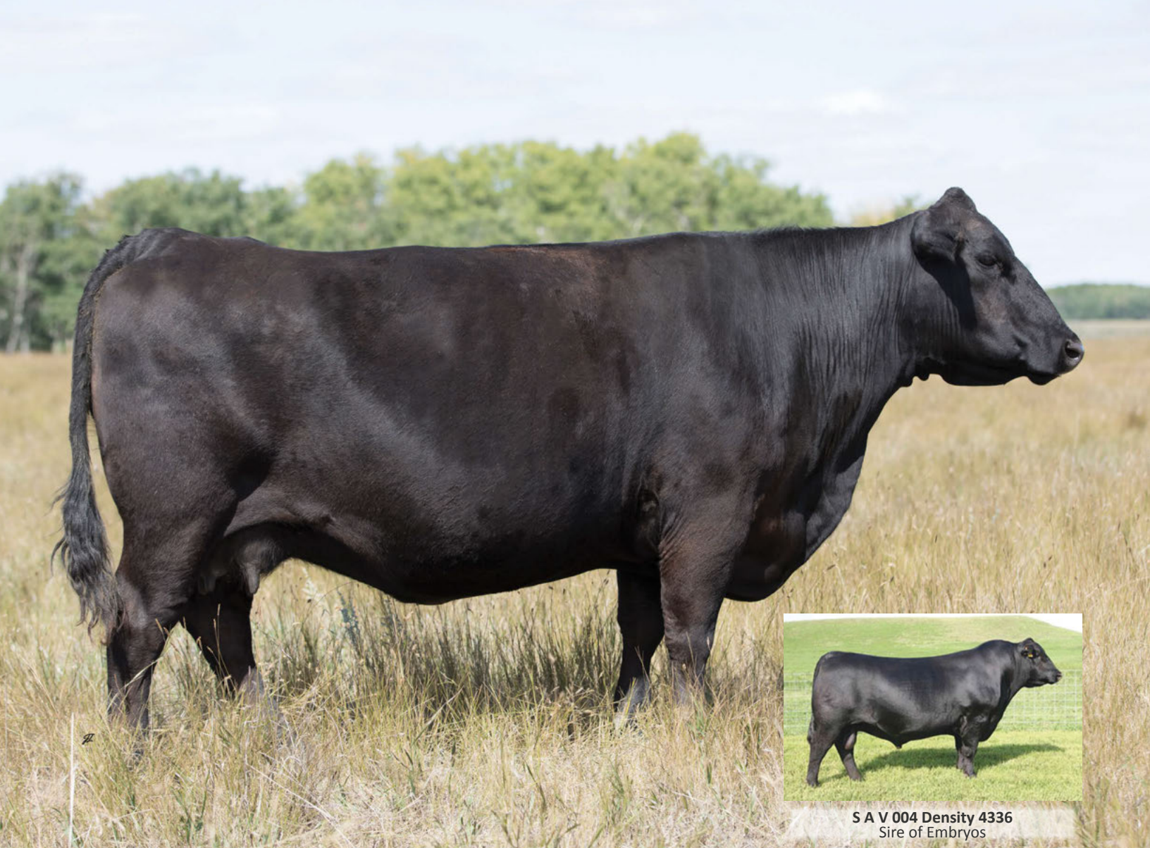
S A V 004 Density 4336 Sire of Embryos