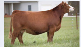
TJSC Onyx 44B Dam of LLSF Flirt F195