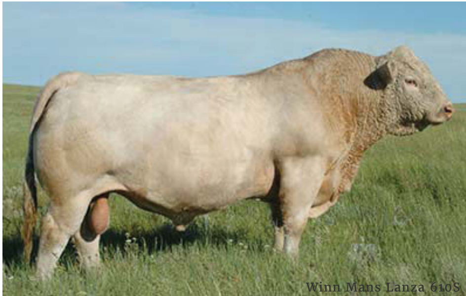
Winn Mans Lanza 610S