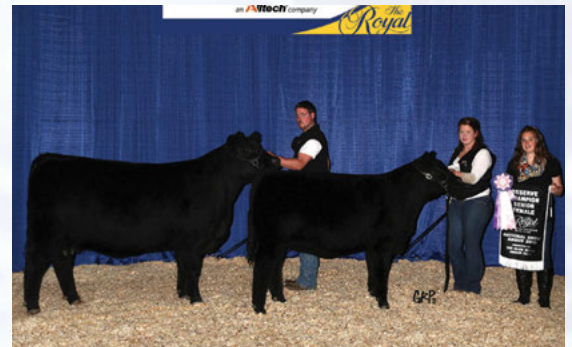
GF Crushmaid 100B With maternal sister to Dam at side