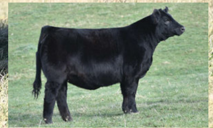
GF Emerald 301H Dam of Embryos