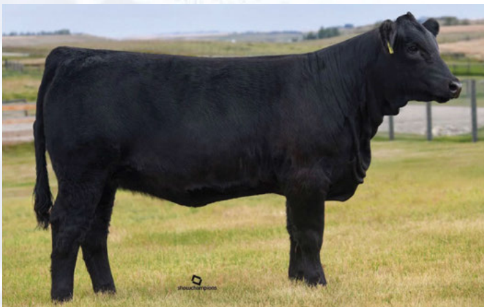
Cobra daughter out of Ankony Miss Candace U056