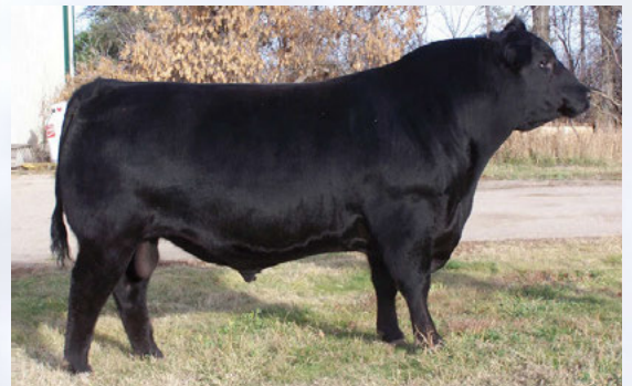
Figure 8 Angus Tom Boy 509R Sire of Embryos

LLB Lady Burgess 447S was an outstanding Free Wheeler 191N daughter that went on to be the 2007 Royal Winter Fair Supreme Champion for Dudgeon Livestock. Tom Boy 509R is a straight Canadian bred herd sire that was our $60,000 top seller selected at the 2007 Agribition Masterpiece Sale. Guaranteeing two (2) pregnancies, if implanted by a certified technician. Embryos are stored at Davis-Rairdan Embryo Transplants Ltd., AB. Offered by LLB Angus