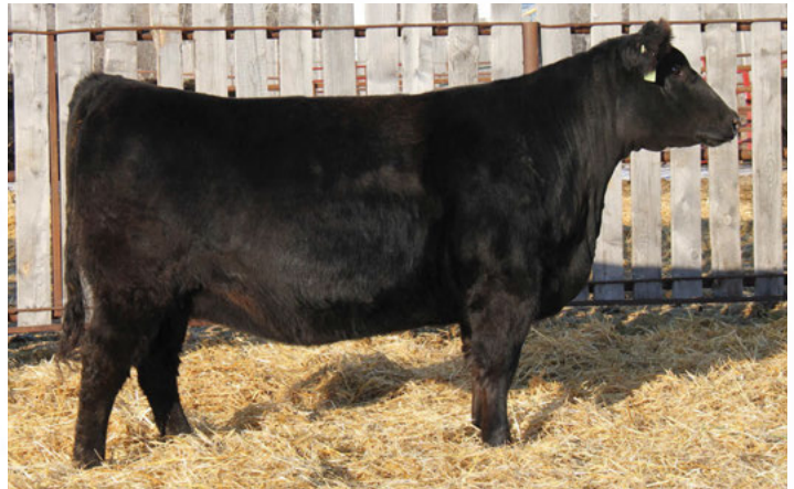
Resource Daughter In production at Rogers Custom Farming