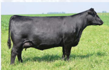
S A V Blackcap May 273 Dam of Siebring Blackcap May 733

Guaranteeing one (1) pregnancy per three embryos, if implanted by a certified technician. Embryos are stored at Oxford Bovine Veterinary Services. Offered by Meadow Bridge Angus