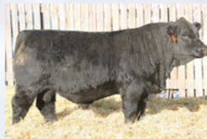
Son of 210B