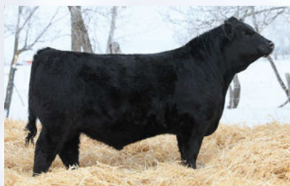
Jaymarandy To The Max 9003G Son of Young Dale Tilda 733E