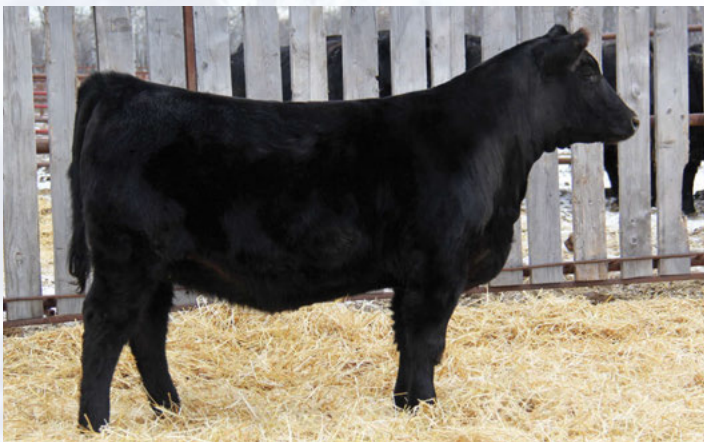
Angus Ranch Daughter In production at Schwan Angus Ranch