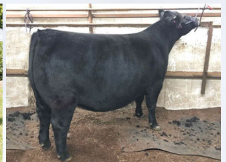
GF Allegra 200E Maternal sibling to embryos