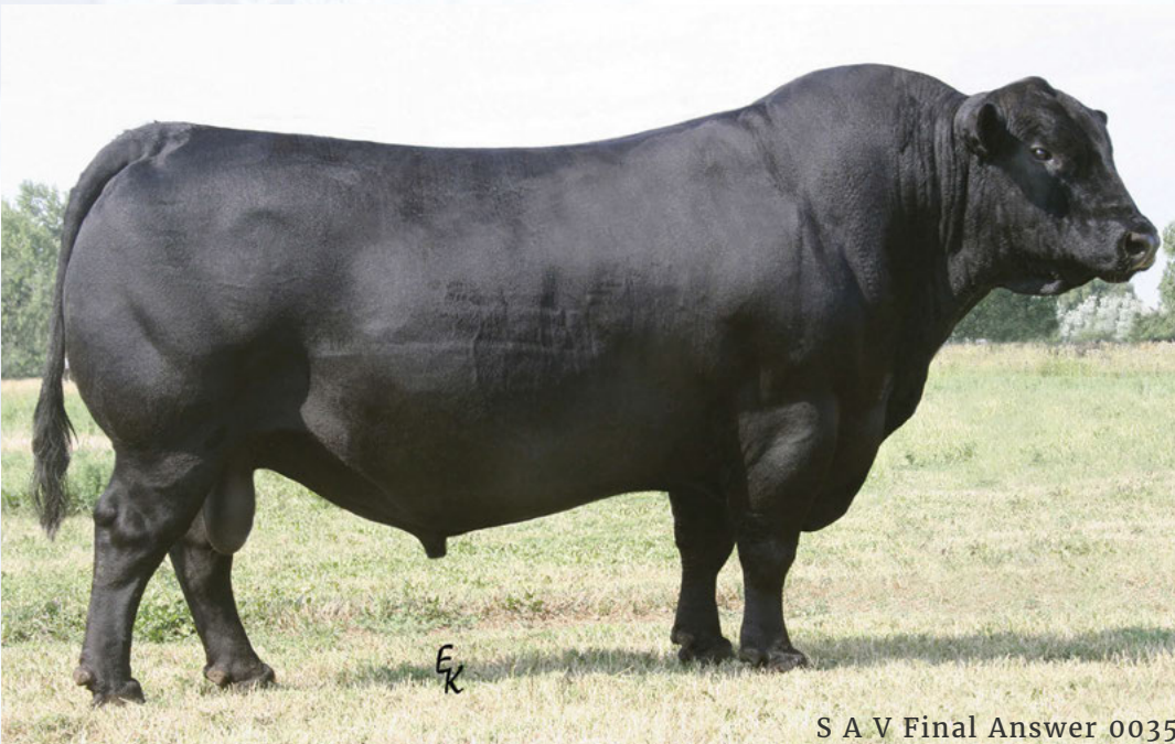
S A V Final Answer 0035

Semen is stored on farm, ON. Offered by Grist Farm