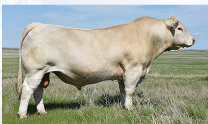
LT Landmark 5052 PLD Sire of Lot 70A Embryos

Guaranteeing one (1) pregnancy, if implanted by a certified technician. Embryos are stored at Bow Valley Genetics, AB. Offered by Prairie Cove Charolais