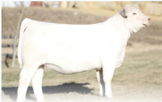
Miss Prairie Cove 16H Outsider daughter at Cay's Cattle