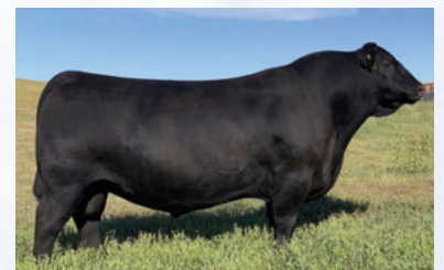
S A V Territory 7225 Sire of Embryos