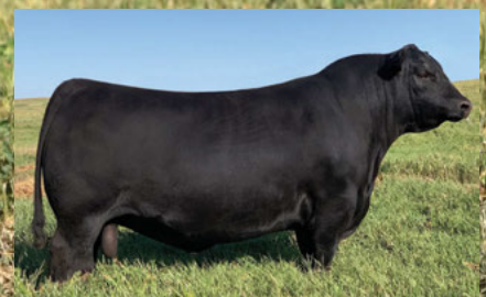
S A V America 8018 Sire of Embryos