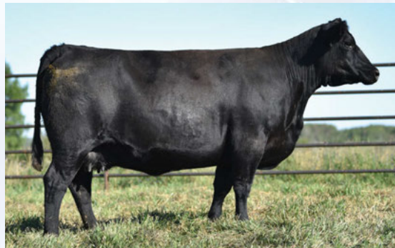
JL Forever Lady 7141 $10,000 Resource daughter at MWC Investments Inc.