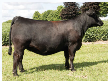
Gillco Allegra 2G Maternal sister to Gillco Allegra 2A

Guaranteeing one (1) pregnancy, if implanted by a certified technician. Embryos are stored at Ranchland Veterinary Services, SK. Offered by Strongbow Farms Ltd.