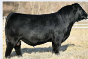
JBSF Berwick 41F Sire of Embryos