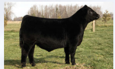
Premier Rip 29H Fusion Son