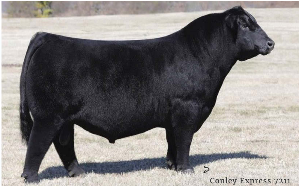
Conley Express 7211

Lot Three (3) Units of Sexed Female Semen 07A Male IMP 7211E 2136235 Mar. 27, 2017