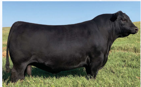
S A V America 8018 Son of S A V President 6847