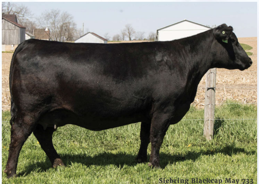
Siebring Blackcap May 733