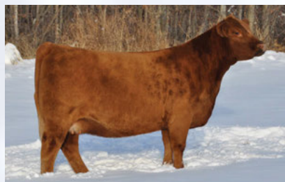
Boss Lake Ms Molly 814F Full Sibling to Lot 76A Embryos