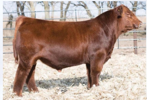
Bailey's One Of A Kind Sire of Lot 88B Embryos