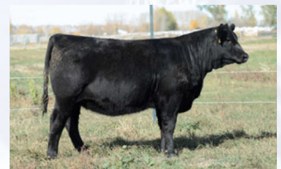
Blair's Shake That 579H Tribute Daughter