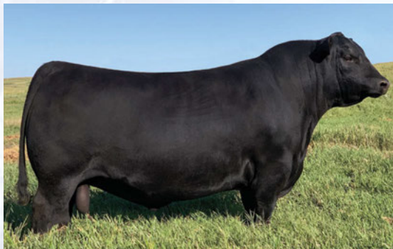
S A V America 8018 Sire of Lot 89A Embryos

Embryos are stored at Bow Valley Genetics, AB. Offered by Skull Creek Ranches