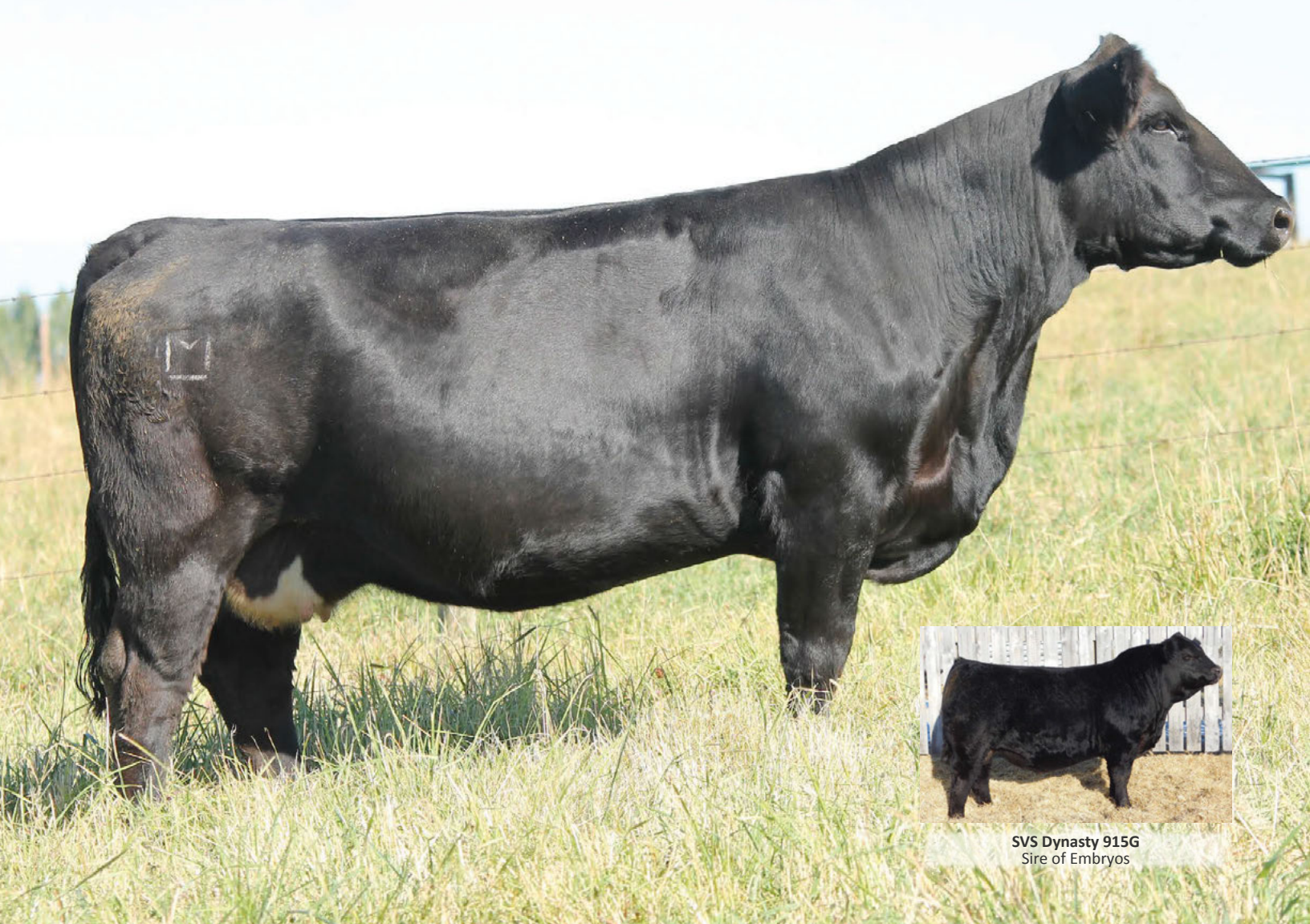
SVS Dynasty 915G Sire of Embryos