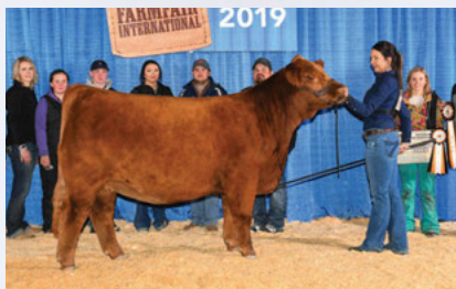
Boss Lake Ms Molly 814F Full Sibling to Lot 76A Embryos

Lot 76A - Exportable to Australia and USA Lot 76A - Canadian Qualified Offered by Boss Lake Genetics