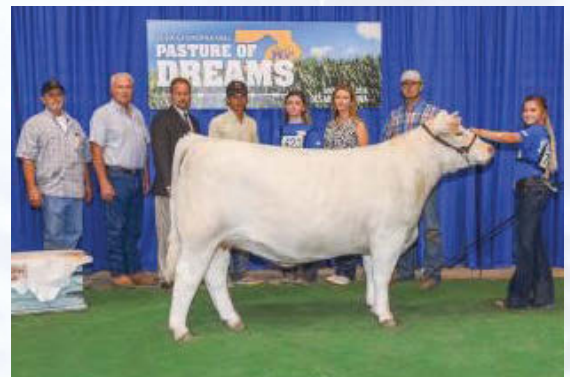
National Champion daughter of Resource

Offered by Prairie Cove Charolais and Serhienko Cattle Co.