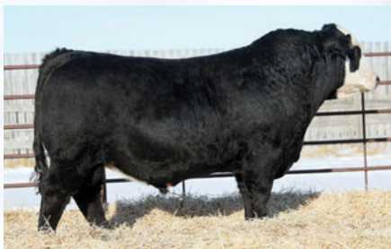
Double Bar D Bankroll 804F