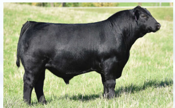
GF Lucknow 905G

$40,000 Stunner son, sold to Karalisha Cattle Company