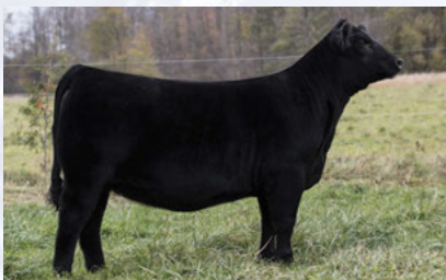
Premier BC Beauty 802 Daughter of Gibson 7024 Beauty 115B

Guaranteeing two (2) pregnancies, if implanted by a certified technician. Embryos are stored at Heartland Animal Hospital and Vet Services, ON. Offered by Premier Livestock