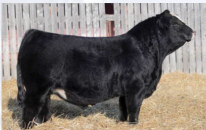
BLI/RNBW Stillwater 31H Uppercut son