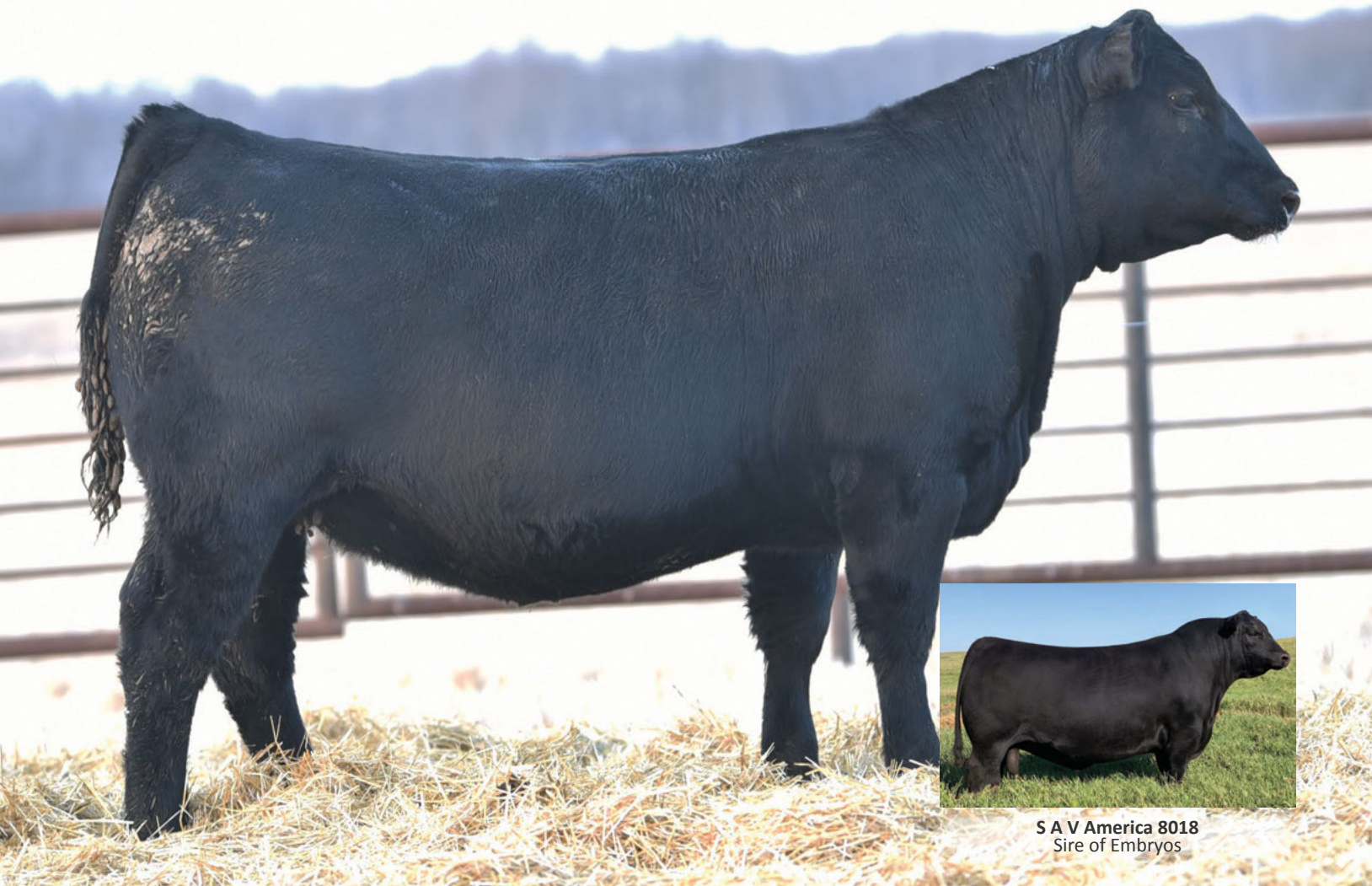
S A V America 8018 Sire of Embryos