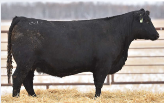
JL Glory 9199 Daughter of S A V President 6847