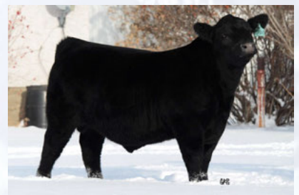
Pedersen Habanero 51H Son of Pedersen Mardi 5C