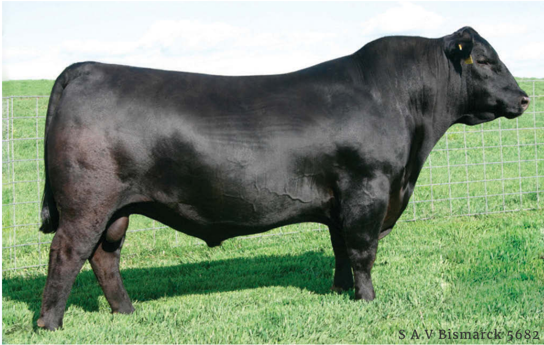
S A V Bismarck 5682

Lot Ten (10) Units of Sexed (90) Female Semen 10A Male IMP 5682R 1369591 Feb. 1, 2005 S A V Bismarck 5682