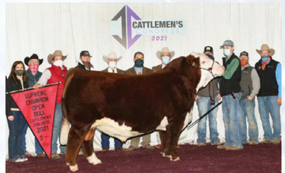
Haroldson's United 33D 36G Sire of Embryos

In a time when there haven't been many opportunities to win, that's all this duo has done! In December, Firefly 35Z was crowned Hereford Miss World and in January, United added US National Champion to his already impressive resume. As if that wasn't enough, United went on to be Supreme Champion Bull over all breeds at the 2021 Cattlemen's Congress. Don't miss out on what could be one of the only opportunities to add United to your 2022 calf crop and don't overlook what Miss World can bring to this genetic opportunity. Guarantee of one (1) 90 day pregnancy per 3 embryos if implanted by a certified technician. Embryos are stored at Davis-Rairdan Embryo Transplants Ltd. Offered by Iris Creek Farms