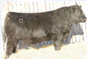
Son of 27C