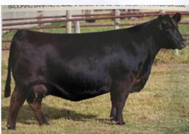
Brooking Beauty 8062 Maternal sister to Brooking Beauty 8138