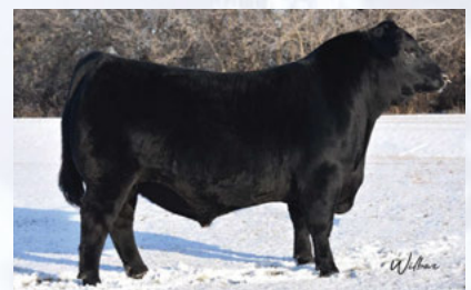
Conley South Point 8362 Sire of Embryos

February Freeze 2021 • Live on DLMS • February 20, 2021