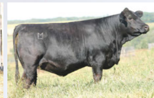
Daughter of 210B