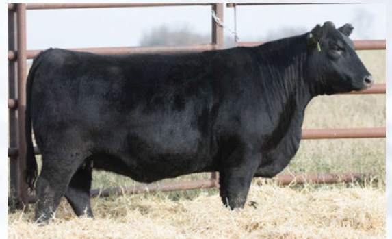
J Square S Ruth 906G Full Sibling to Embryos