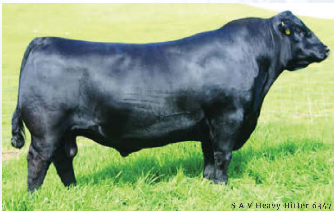
S A V Heavy Hitter 6347

We have three straws for the February Freeze sale from S A V Heavy Hitter 6347, he is the most impressive son of S A V Traveler. He is long made, deep made and has good EPDs to go with it. Here is an opportunity to get semen of Heavy Hitter that is hard to come by!