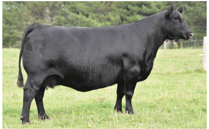
Gillco Allegra 2A Donor Female Currently in Embryo Transfer