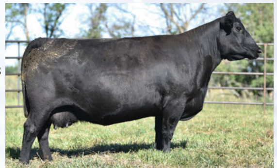
JL Evening Tinge 1380 Dam of JL Evening Tinge 5110 In production at Clegg Angus, AB