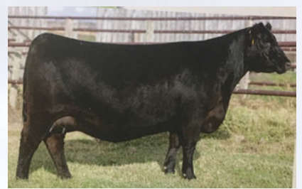
Maternal sister to Brooking Beauty 8138