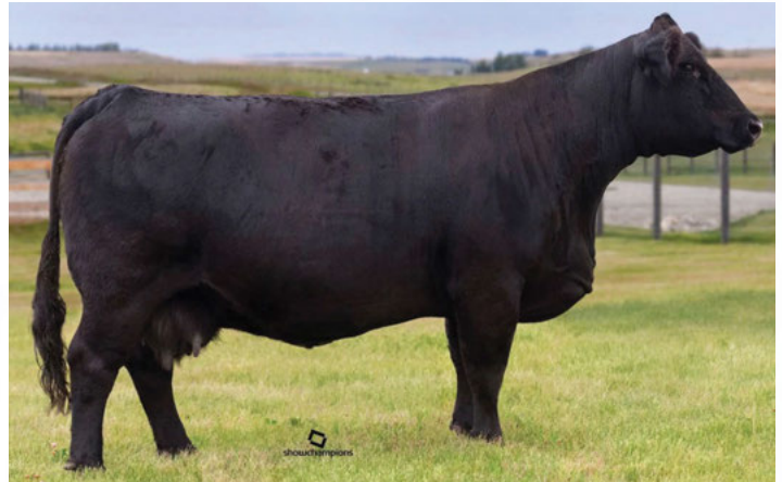
Ankony Miss Candace U056 Dam of Embryos