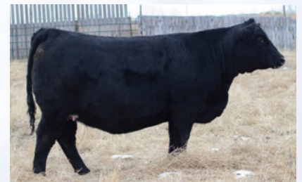
BLI Fortune 915G Uppercut daughter

Offered by SIBL Simmentals, CRM Simmentals and R Plus Simmentals