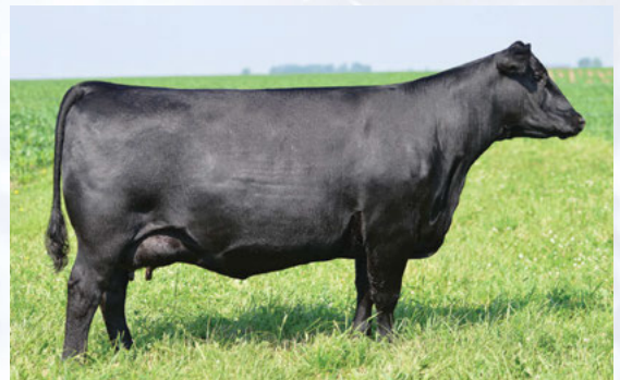
S A V Blackcap May 273 Dam of Siebring Blackcap May 733

Blackcap May 733 was purchased as a bred heifer from Siebring Angus and we are thrilled with her! She is a hardworking mamma cow, raising two of our best bulls to date. She is sired by S A V Cutting Edge out of Blackcap May 273, the 9969 daughter of 2397. Half-interest of 473, another 273 daughter, sold to ZWT Ranch for $300,000. Other daughters have highlighted past Siebring Angus sales and the North Perth Angus Dispersal. 733 is moderate framed and feminine fronted with tremendous feet and legs. A problem free cow with a bright future..these embryos are not easy for us to sell. Guaranteeing one (1) pregnancy, if implanted by a certified technician. Embryos are stored at Oxford Bovine Veterinary Services. Offered by Meadow Bridge Angus