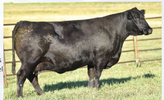
JL Tierra 6059 Dam of JL Tierra 0016 In production at Gavin Cattle, PEI