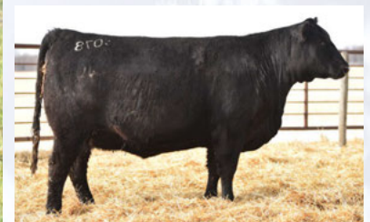
JL Forever Lady 9078 $42,000 Renown daughter at Cuddy Farms