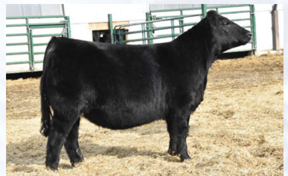
GF Emerald 301E Dam of GF Emerald 301H

Offered by Alton Century Farms Ltd. and Gilchrist Farms