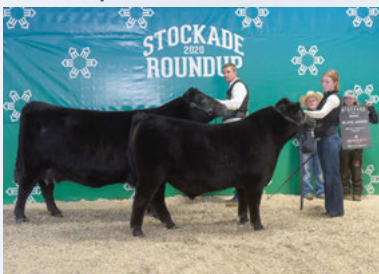
Pedersen Mardi 5C with Calf 2020 Stockade Round-Up Senior Champion Female