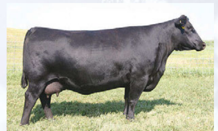
S A V Madame Pride 5290 Dam of Mohnen General 548