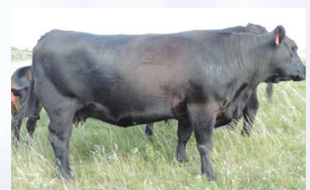
Z-Bar Rosebud Lass 23E Eric Granddaughter