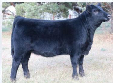
Pedersen Mardi 124G Maternal Sibling to Pedersen Mardi 5C