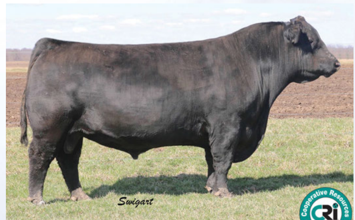
Musgrave Boulder Sire of Lot 33C Embryos