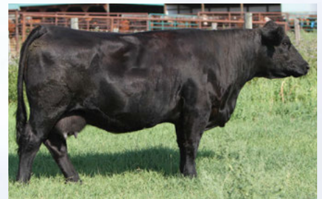
LFE Heaven Sent 30X