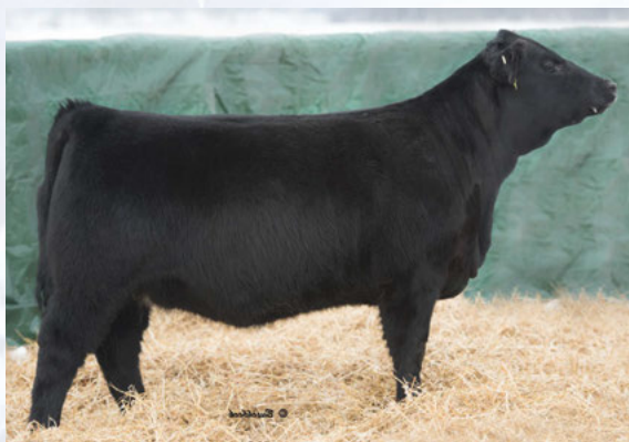
Harprey Birdie 62H Daughter of Young Dale Julian 64E

Semen is stored at Bow Valley Genetics, AB. Offered by Harprey Angus