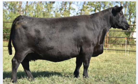
JL Floressa 8214 Maternal Sister to JL Floressa 5531 13-year-old donor at Skull Creek Ranches, SK

Guaranteeing six (6) embryos with an open top. Offered by Larch Grove Farm Ltd.