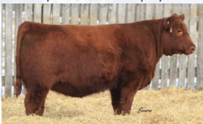
Red LHCC Bayberry 022H

$9,000 high selling daughter at Keystone Classic