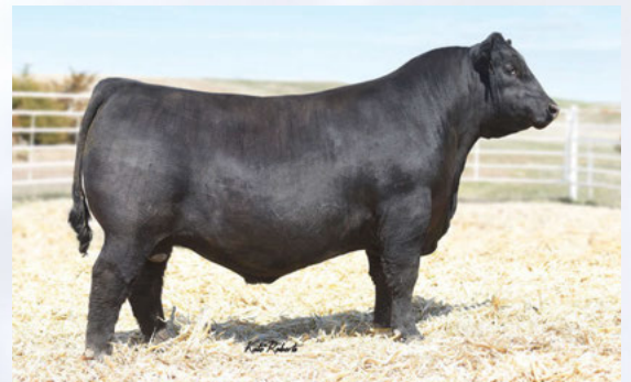
Mohnen General 548 Sire of Embryos