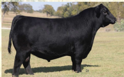
Conley South Point 8362 Sire of Lot 41A Embryos