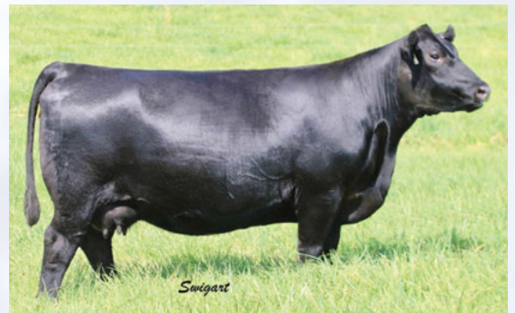
PVA Blackcap May 4397 Dam of PVA Blackcap May 8297

Guaranteeing one (1) pregnancy per three embryos, if implanted by a certified technician. Embryos are stored at Oxford Bovine Veterinary Services. Offered by Meadow Bridge Angus