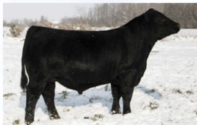
Premier Gold Chip 913 Son of Gibson 7024 Beauty 115B