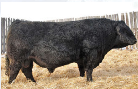
LFE McDavid 413C

Semen is stored at Alta Genetics, AB. Offered by Spring Creek Simmentals