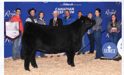
Boss Lake Ms Molly 812F Full Sibling to Lot 76A Embryos