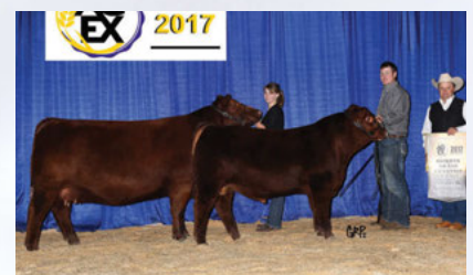
Red Double MM Bayberry 1Z with Calf

2017 Ag Ex Reserve Grand Champion Female